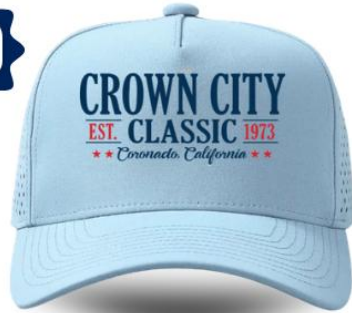
CROWN CITY HAT