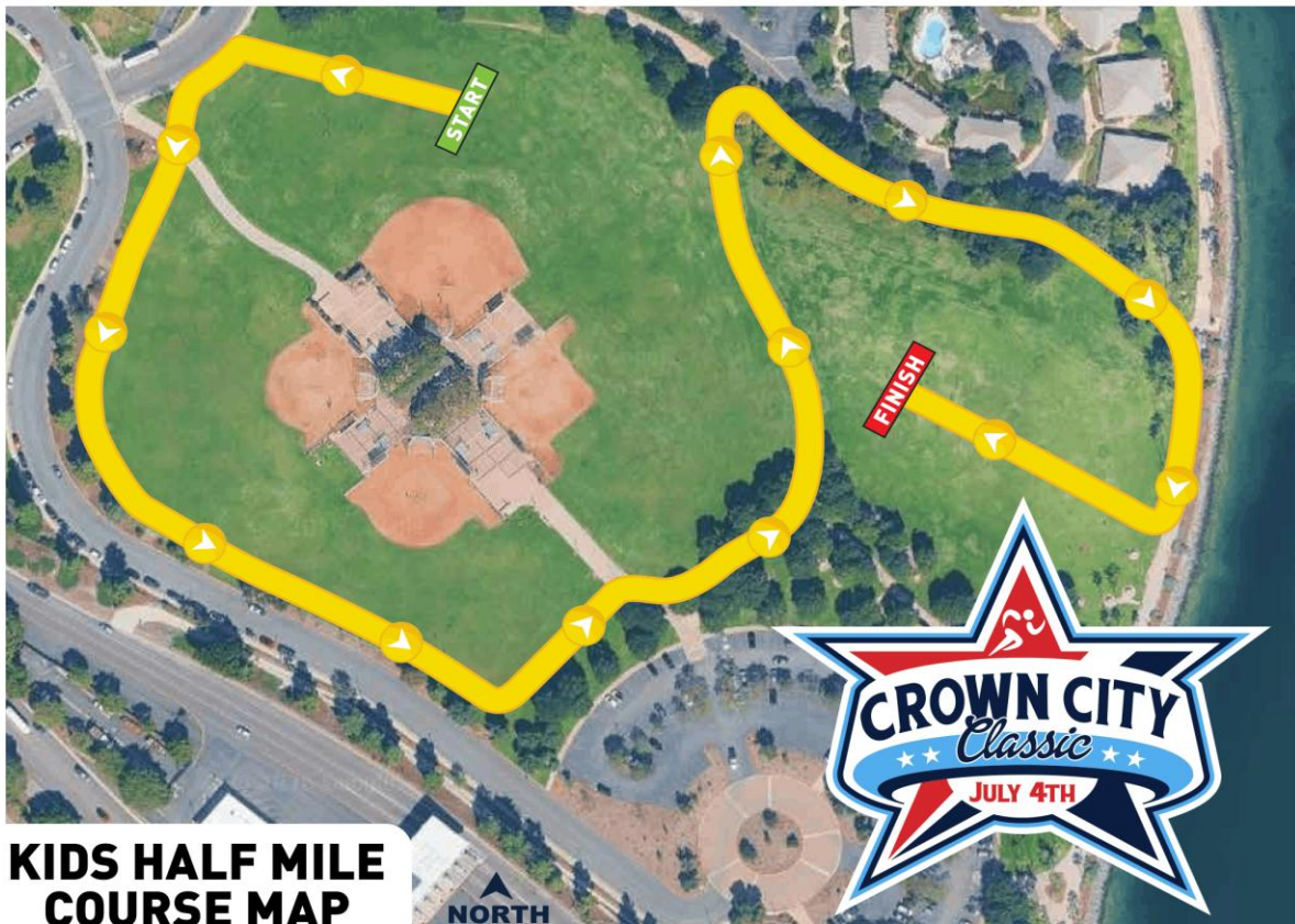
KIDS HALF MILE COURSE MAP

Parents are permitted to run with their children. The start and finish lines are close enough that, should a parent not run with their child, they can easily view both the start and finish of their child's run. Please be careful when crossing the park, as you will need to cross the kids ½ mile route when moving from the start to the finish line.